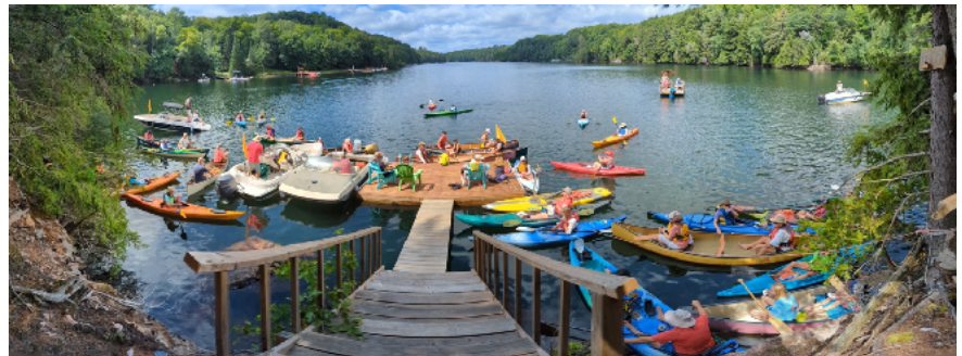
Photo: Waiting for the Poker Run Prizes