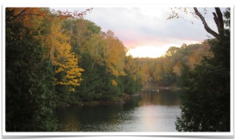
Fall Colours on Wenona Lake