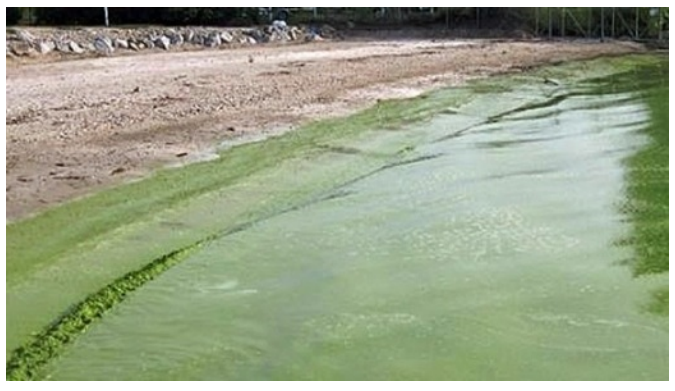
A Blue Green Algae Bloom near Sudbury

A small amount of Phosphorus moves in a cycle through rocks, water, soil, sediments and organisms. When excess phosphorus is permitted to enter our waterways because of poorly functioning septic systems or fertilizers applied to lawns, it causes excessive growth of aquatic plants such as algae.