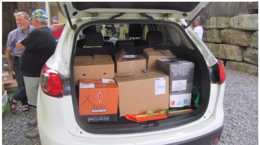
Donations boxed up and ready to be delivered to the Haliburton Food Bank