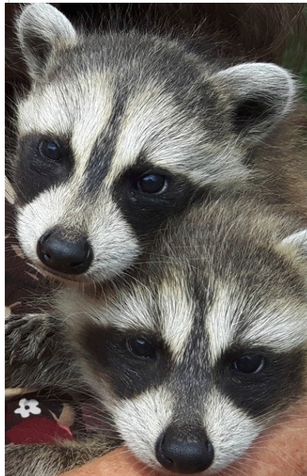
1ST RON OWTTRIM (Wenona)

We are pleased to announce the winning photos from MACA's Photo Contest. This year's theme was "Wildlife at the Cottage". In total we had 34 entries. A very impressive array of photos, including raccoons, deer, fish, snakes, butterflies, caterpillars, squirrels, turtles, a salamander and 5 kinds of birds.