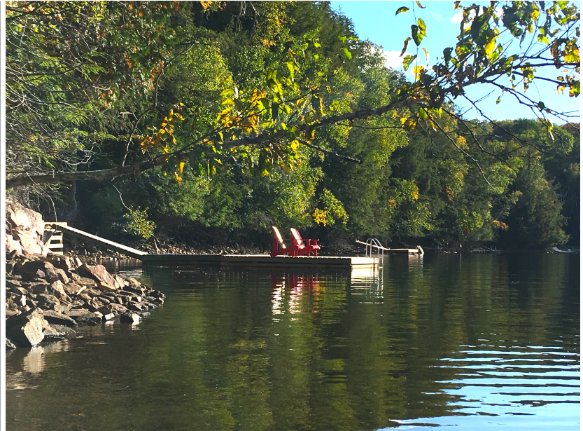
Miskwabi Lake, September 2019