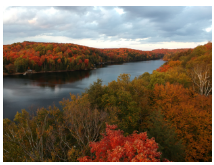
Long Lake, Photo: Steve Dyce