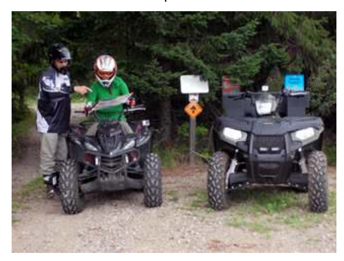
Put Safety First

For more info or membership visit haliburtonatv.com