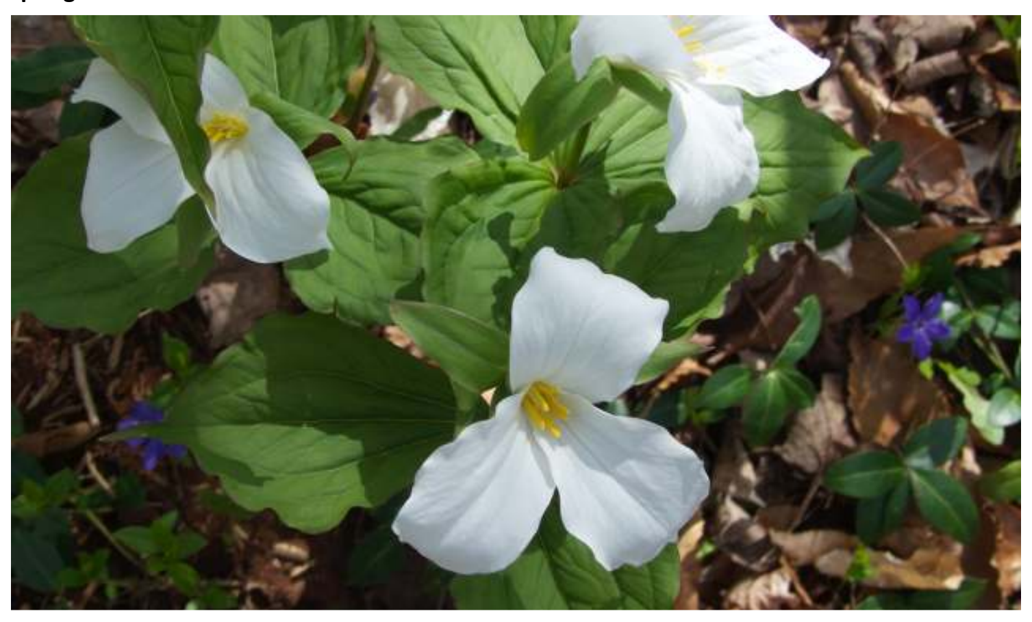
Large Flowered Trillium

Welcome back to the lakes – it was a very cold winter with deep ground frost and as of writing (April 15) ice still on the lakes with some open spots along the shores.