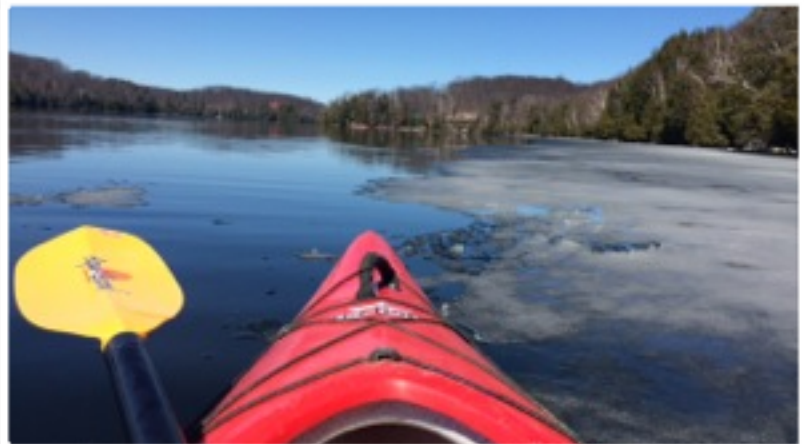
Breaking the ice, Miskwabi Lake, April 2016