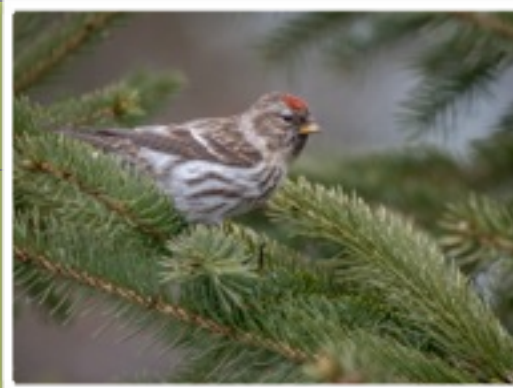
Common Redpoll