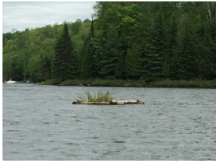
Wenona Lake South end

As we reported in the Winter MACA Newsletter, Haliburton County's Land Division Committee is considering an application to create three new lots at the southern end of Wenona Lake. The proposed lots would be accessed by a new road off Trapper's Trail.