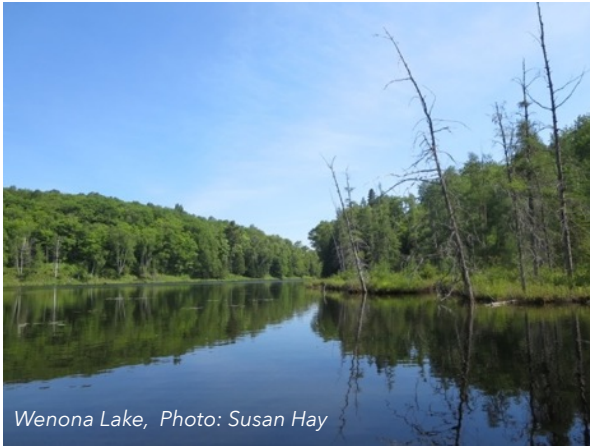
Wenona Lake

After a process that lasted more than a year, a compromise was reached in April regarding the new lot severances on Wenona Lake.