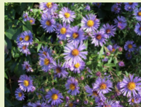
Aster - plant in full sun. Hardy plants seen growing at roadsides. Small white or blue flowers.