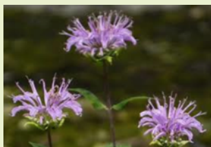
Wild bergamot - generally an easy wildflower to grow. Likes full sun and tolerates dry soil. Leaves and flowers have a sweet fragrance. Lavender-coloured flowers attract bees and butterflies.