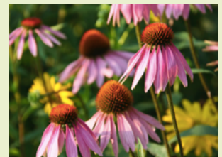
Coneflower - pink-purple flowers from midsummer to late fall. Plants are tolerant of poor soil and dry conditions.