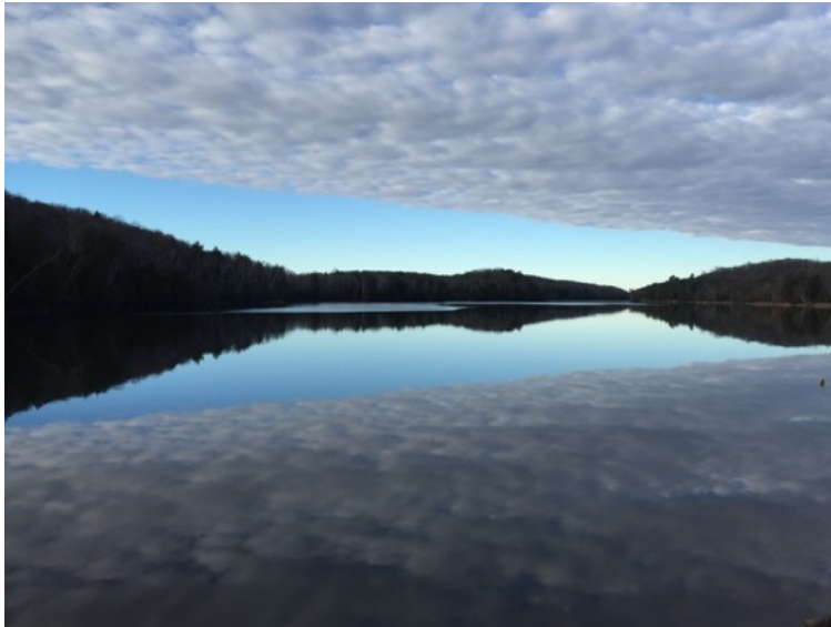
Clouds over Long Lake