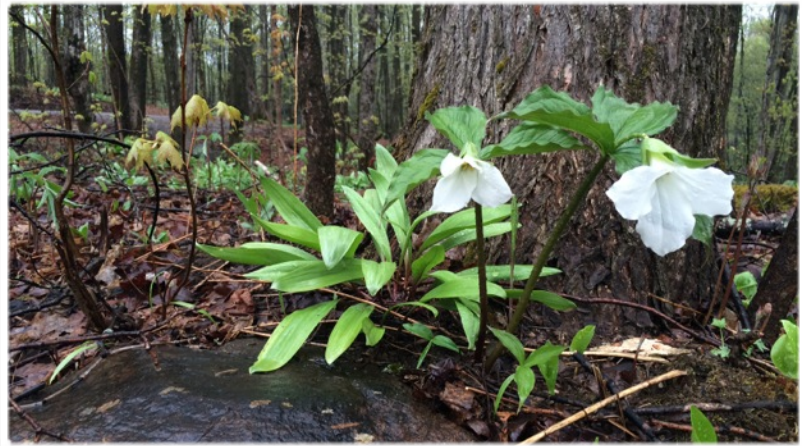
Spring Trilliums

Details inside this edition of the Newsletter