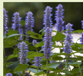
Anise hyssop - Full or part sun. Loamy soils. Starry-shaped flower heads. Showy flowers in summer, fall.

You can find these plants - and many others - at the annual Master Gardener plant sale in Minden. This year's sale will be held on Saturday June 3, 2017. It's first come, first serve – so arrive by 9:00 am to take a number, and then browse the plants. Come early for best selection. Held in downtown Minden at the Village Green park (beside CIBC). The Master Gardeners are happy to provide expert advice on plants that will thrive in Haliburton County.