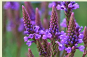
Blue Vervain (Verbena) - plant in full sun. Moisture tolerant. Purple flowers bloom in late summer.

To attract bees and other pollinators to your garden, try planting some of these perennials. Even what seems like a small contribution – just a tiny flower pot or patch – can provide valuable pollinator habitat.