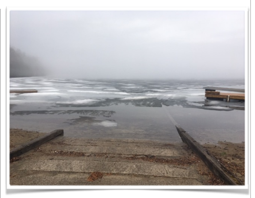
Miskwabi Boat Launch May 3rd, 2018