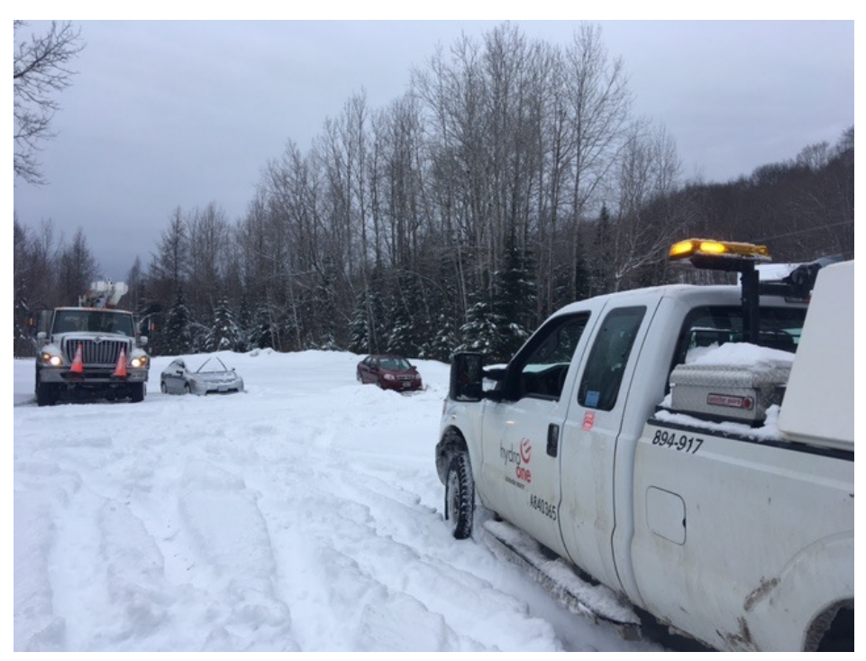
Late Spring Storm - Trapper's Trail Road - April 15th, 2018

For more information, visit the septic information page on Dysart's Web site at: <a href="https://www.dysartetal.ca/portfolio-view/septic-systems/">https://www.dysartetal.ca/portfolio-view/septic-systems/</a>