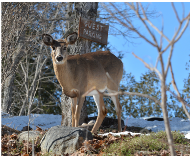
Deer Parking