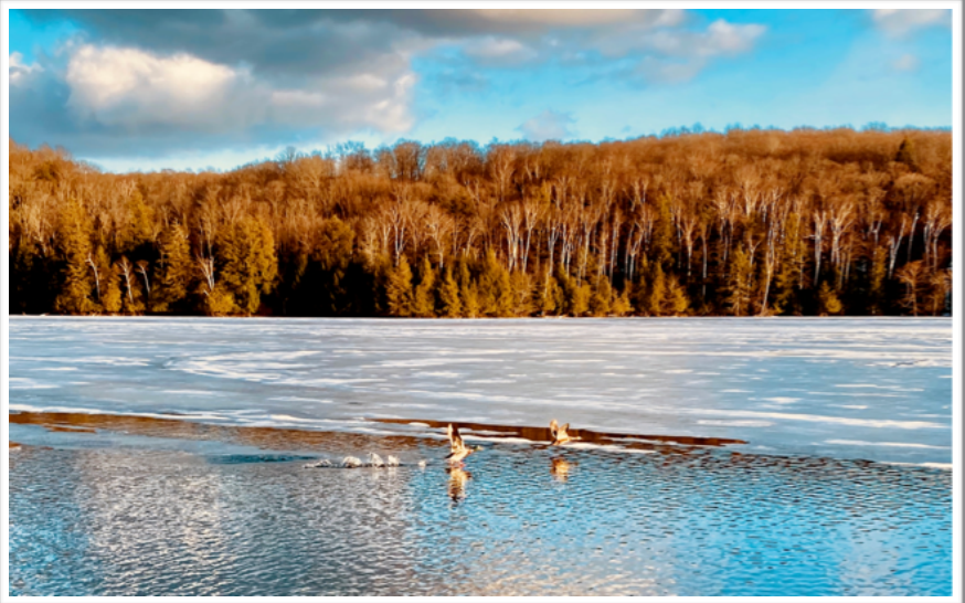
Ducks Taking Off on Long Lake