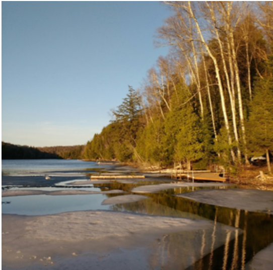
Spring Around the Corner