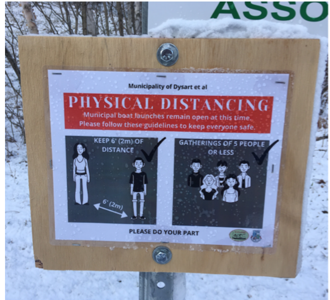
New Signs at the Boat Launch