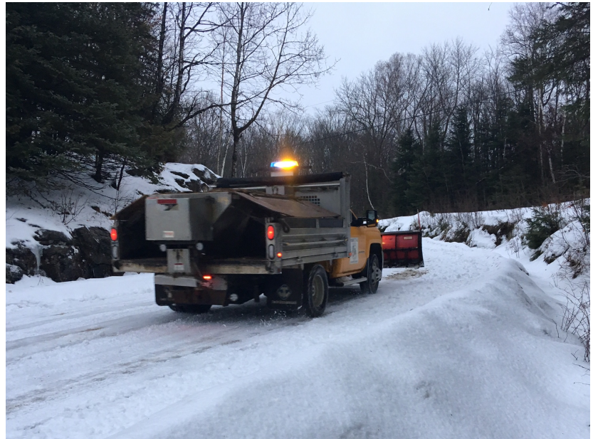
Plowing Trappers Trail Rd.